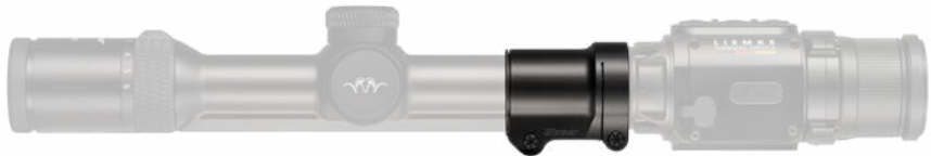
Blaser B2 1–6x24 iC S

Secured against rotation, locked against being pulled off to the front and clamped into place