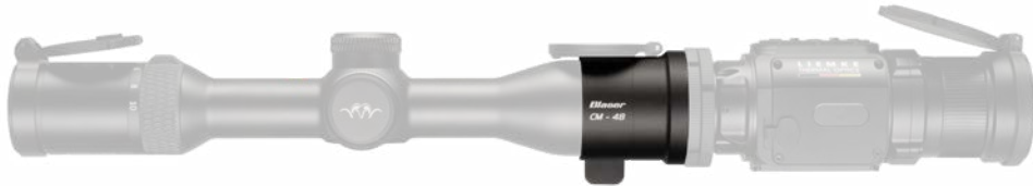
Blaser B2 1.7–10x42iC