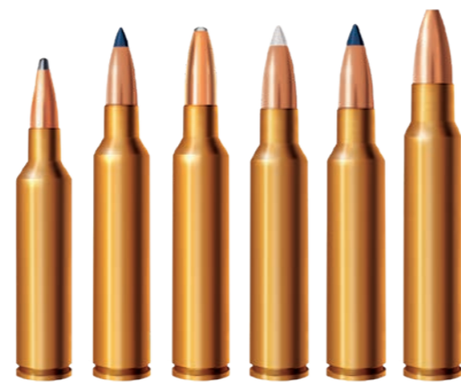
The range of Blaser Magnum cartridges from left to right: 7mm Magnum with Hornady Interlock bullet; .300 Magnum with TTSX bullet; .300 Magnum with CDP bullet; .338 Magnum with Nosler AccuBond bullet; .338 Magnum with Barnes bullet; .375 Magnum with Barnes bullet

The Blaser Magnum calibers are available with Hornady Interlock, Nosler AccuBond, Barnes TSX/TTSX and Blaser CDP bullets. Norma also offers additional loads under its own company label.