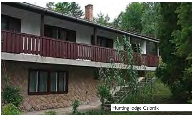
Hunting lodge Csibrák

HUNTING AREA: 7,577 ha NATURAL FEATURES: 65 % woodland ACCOMMODATION: Hunting lodge Obirod, 11 double rooms and 2 apartment