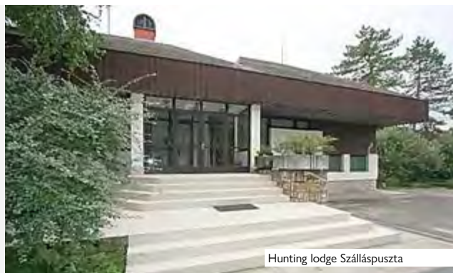
Hunting lodge Szálláspusztá